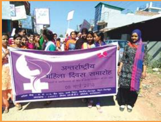
Rally by the beneficiaries