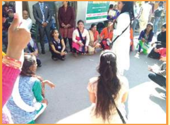
Nukkad natak by the beneficiaries