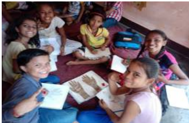
Activities of sports, art and craft, drawing, exposure visits were conducted as part of Summer Workshop